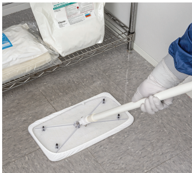
AlphaMop™ 100% Polyester Cover and Pad